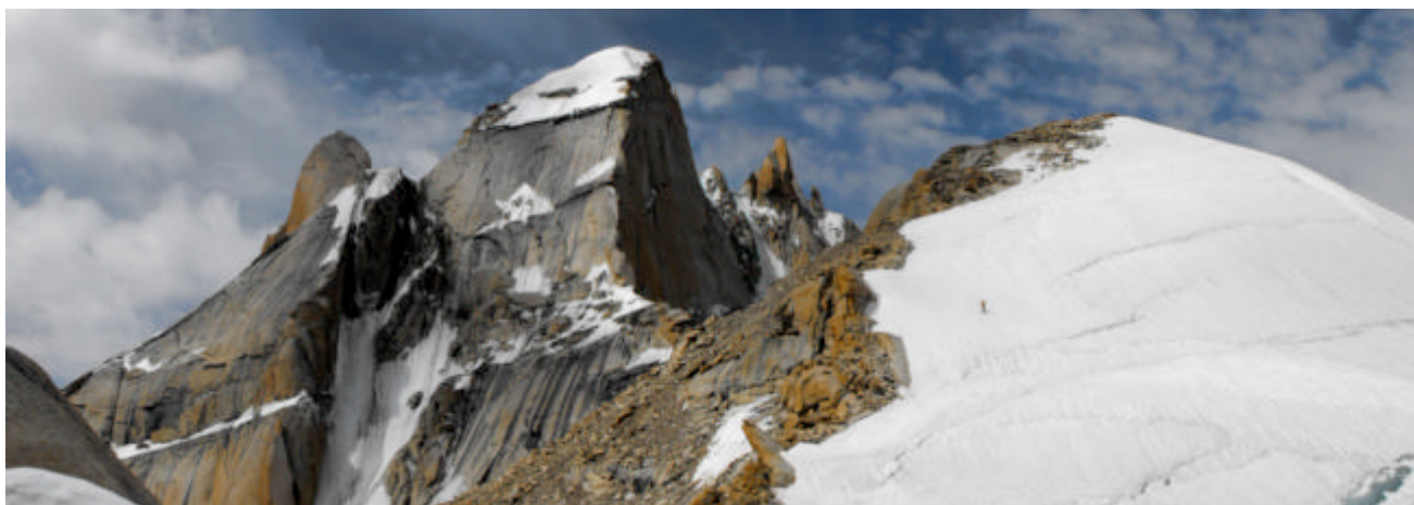
Climber descents from Samgyal peak, the unclimbed spires of Jundung Kangri in the background

In 2011 we returned to the area to focus again on peaks in the main Thanglasgo valley complex and had success on three peaks